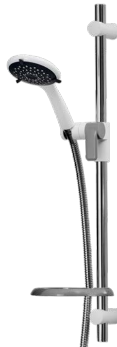
Omnicare Kit GAUF1

Model Number: OMNICARE 8.5kW - TEOMN81 RRP $1,495 (Incl GST)