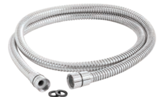
1.5m Anti-twist Hose - Chrome REHOSE150C