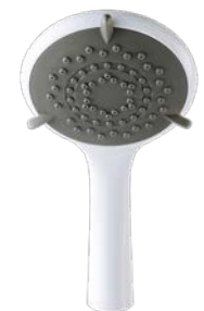
Inclusive Showerhead (5 Spray Pattern) TSHECAREWHT

Contact our customer service at Parex Industries Limited: